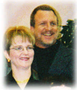
Meet the Pastors: